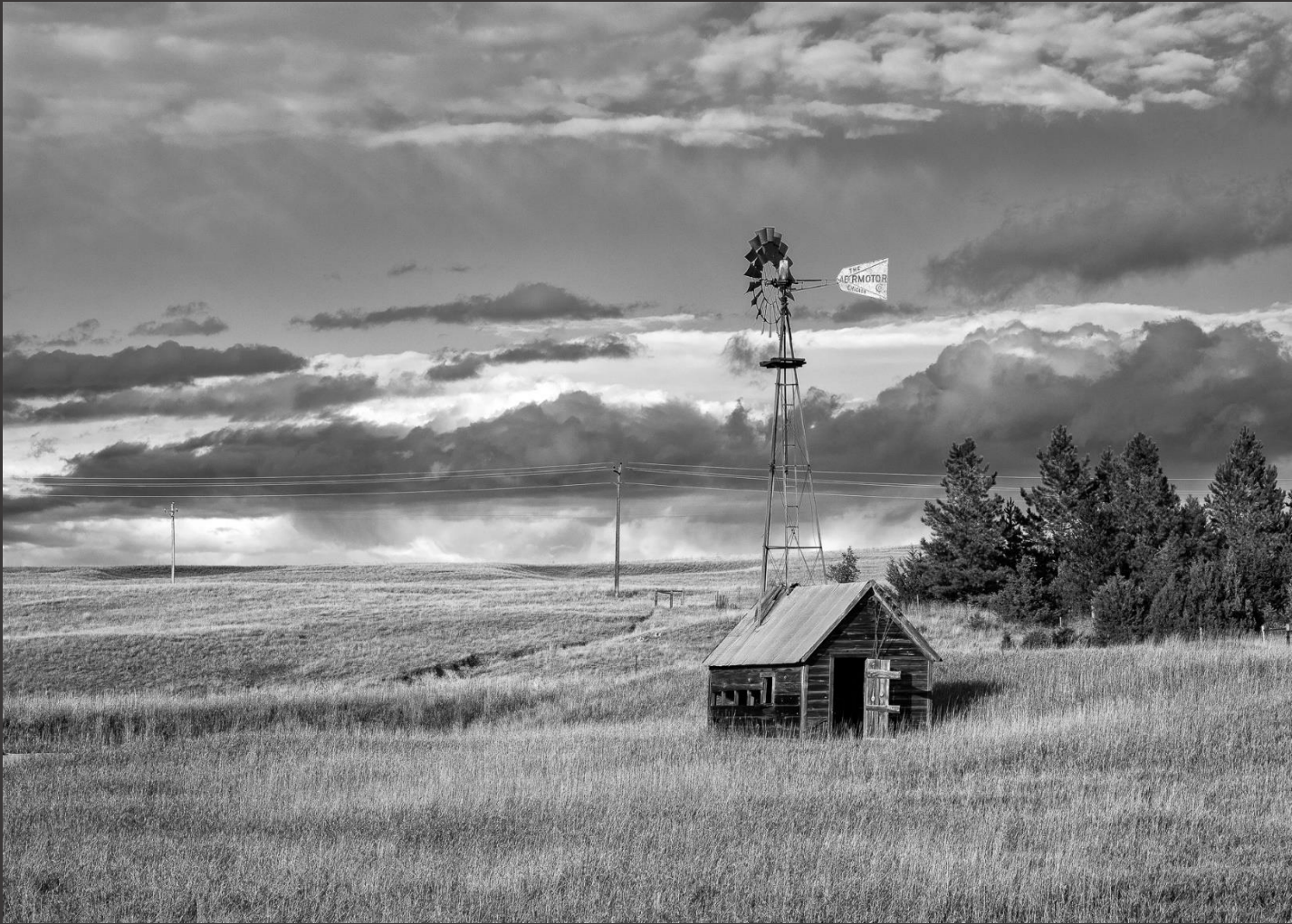
Richard Halliburton Third Place